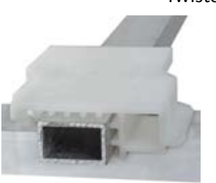
tube (alu. or steel) 40x25x2 mm.